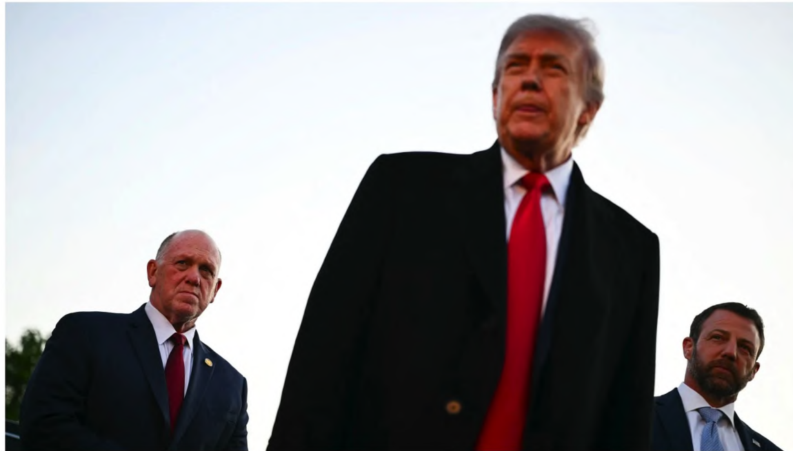
President Trump, flanked by White House 'border czar' Tom Homan (L) and US Secretary of Homeland Security Markwayne Mullin (R), speaks with workers who have been painting the Lincoln Memorial Reflecting Pool in Washington, DC, on May 7, 2026.

The White House plans to start counting people who were quickly removed after crossing the border in its deportation statistics, a change that will put it closer to its goal of one million deportations a year.