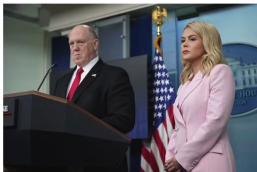
White House press secretary Karoline Leavitt, right, and White House border czar Tom Homan speak with reporters in the James Brady Press Briefing Room at the White

"I explained to her again, it's safer for the community, safer for the officer, and safer for the alien to arrest him in the safety and security of jail," Homan said. "I explained in Minneapolis, what could have been done by one agent, now we got 12, 13 people out there because [of] the security posture, and she clearly understood it."