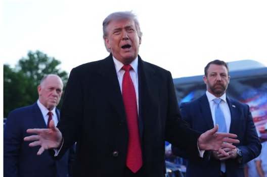
President Donald Trump speaks as he visits the Lincoln Memorial Reflecting Pool to see the new blue protective coating being applied as part of a renovation project, Thursday, May 7, 2026, in Washington, as White House boarder czar Tom Homan and Homeland Security Secretary Markwayne Mullin listen.

Over the past six months, the Trump administration has had its hands tied by the courts, sat through the longest-ever government shutdown of the DHS, and struggled to combat sanctuary cities that continue to prop up blockades to letting ICE make arrests.