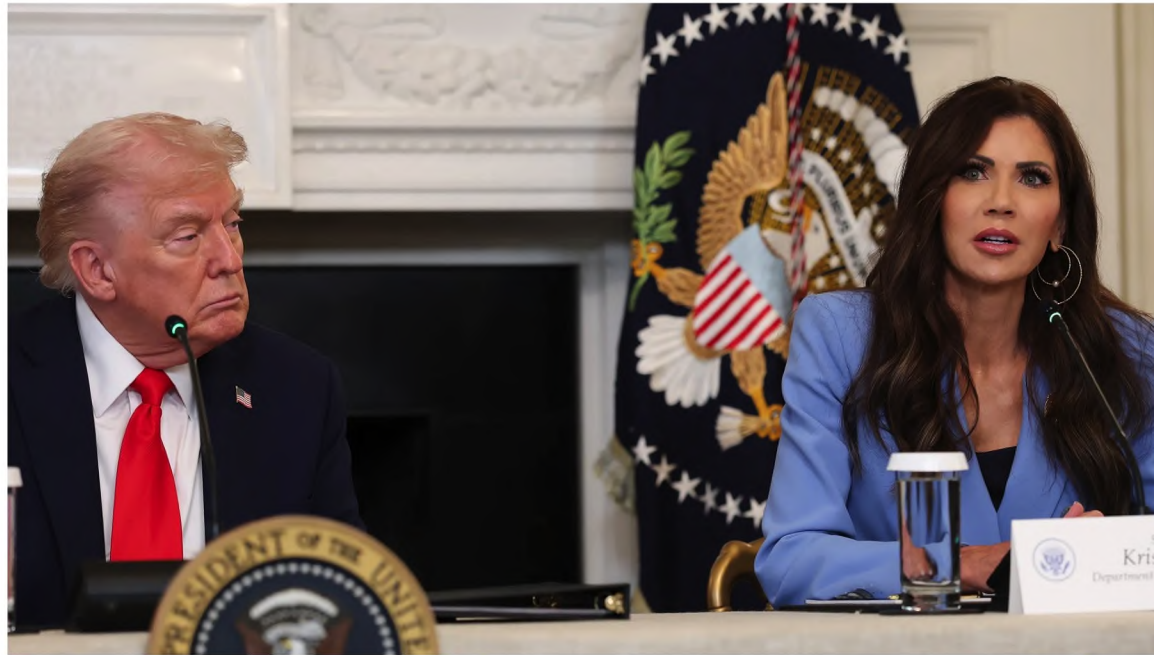
President Trump and Secretary of Homeland Security Kristi Noem at the White House in October.

A Trump -appointed federal judge said immigration enforcement agencies "violated noncitizen detainees' constitutional" rights at a Minnesota facility in a scathing ruling on Thursday.