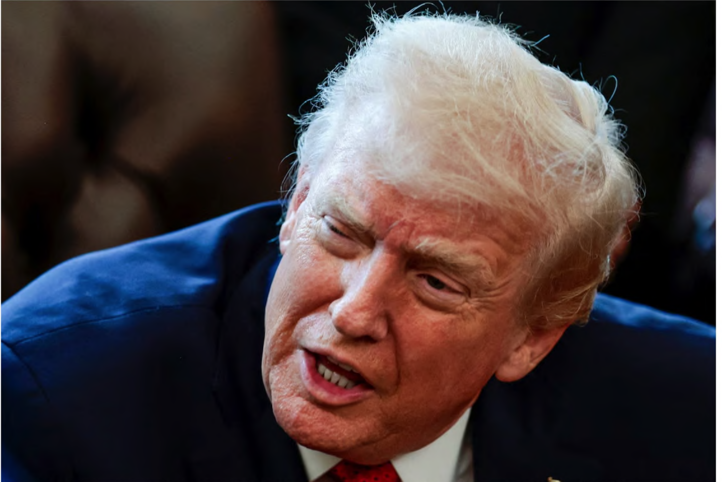
U.S. President Donald Trump speaks in the Oval Office as he signs an executive order, at the White House in Washington, D.C., U.S., December 18, 2025. REUTERS/Evelyn Hockstein/File Photo Purchase Licensing Rights

Jan 14 (Reuters) - U.S. President Donald Trump has repeatedly invoked a scandal around the theft of federal funds intended for social-welfare programs in Minnesota as a rationale for sending thousands of immigration enforcement agents into the Midwest state.