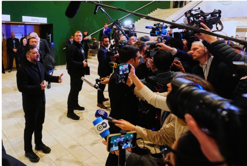
Russia, Ukraine and the US are holding peace talks in Abu Dhabi. They're coming at a key moment