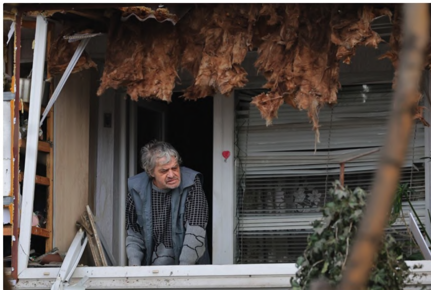
A handful of attempts at a ceasefire in Russia's war in Ukraine have proven futile