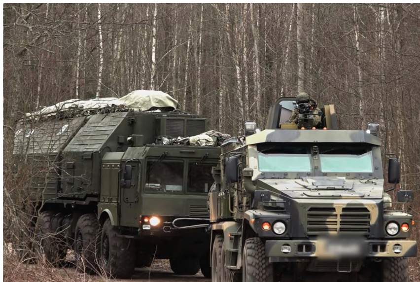
Russia's nuclear-capable Oreshnik missiles have entered active service, Moscow says

The military has called up between 130,000 and 160,000 draftees during each round of conscription.