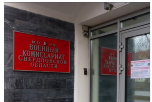
Sverdlovsk Region Military Conscription Office, Yekaterinburg, 6 April 2020

This Law also made no mention of alternative civilian service until nearly eight weeks into the "partial mobilisation". A set of amendments which entered legal force on 15 November introduced a new Article 17.1, which stated that conscripts undertaking alternative civilian service (ACS) upon the announcement of mobilisation would be allowed to carry on doing it, but that those who were serving in state institutions may be moved into civilian roles in the armed forces.