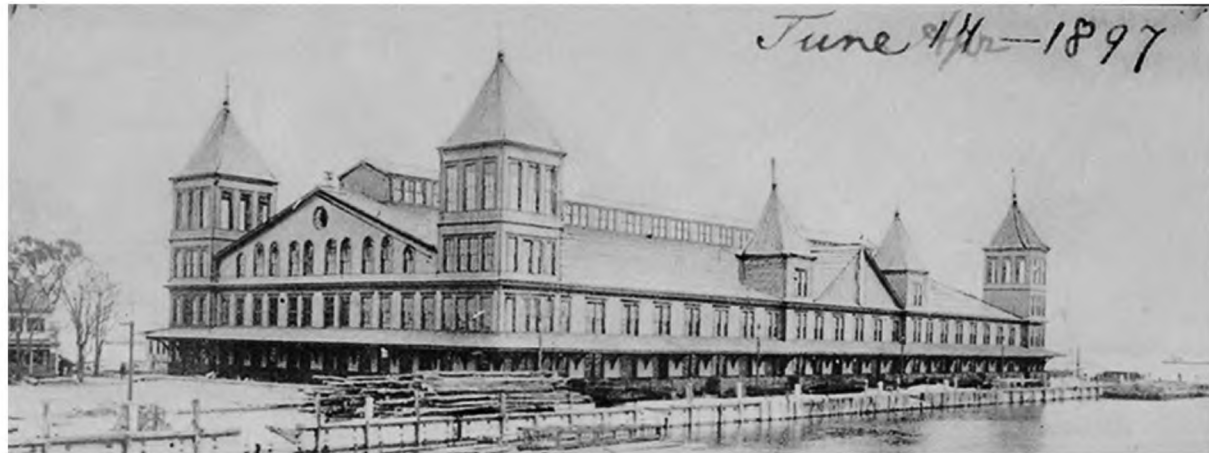
The original Ellis Island buildings were made of wood, above. After a fire in 1897, the federal government rebuilt in brick, and those buildings still stand today.

The Service built additional immigrant stations at other principal ports of entry through the early 20th century. At New York, Boston, Philadelphia, and other traditional ports of entry, the Immigration Service hired many Immigrant Inspectors who previously worked for state agencies. At other ports, both old and new, the Service built an Inspector corps by hiring former Customs Inspectors and Chinese Inspectors, and training recruits.