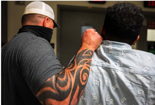
📷 A federal immigration officer detains a migrant at immigration court in New York on 3 September 2025.

In one of the biggest changes in immigration enforcement policies, immigrants with no criminal record continue to make up the largest group in US immigration detention, despite the administration's rhetoric about focusing its anti-immigration efforts on "the worst of the worst" criminals. Being undocumented in the US is a civil not a criminal infraction. The Trump administration has also moved to invalidate protections for many immigrants staying in the US legally.