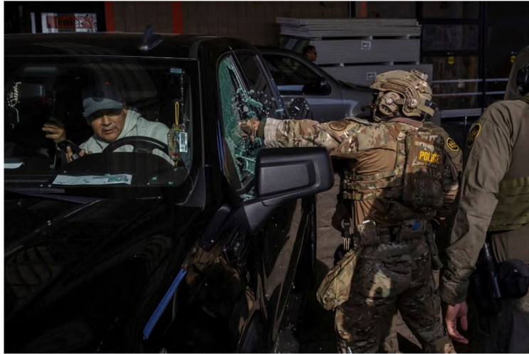
Federal agents smash a car window while trying to detain a man during an immigration raid in Chicago, Illinois, on 17 December 2025.

ICE held more than 68,400 people as of 14 December, breaking previous high set at beginning of December