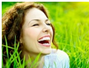
Can you have 20/20 Vision again without surgery?