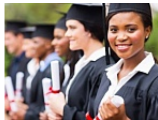
With These College Degrees You'll be Making Six Figures in No Time!