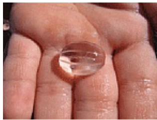
'Skinny' Pill Takes The World By Storm...