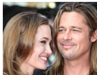
You Won't Believe Who Tops the List as the Most Generous Celebrity!