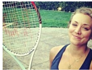
These celebs will motivate you to want to work out!