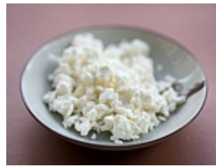
1 Simple Trick Could Remove Cellulite Forever