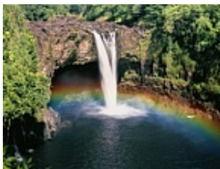
Retire like royalty in these US cities!