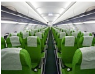
The worst things about Airline Travel