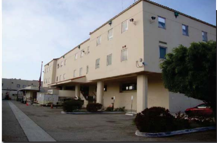
Figure 1: Main building at ICE's San Pedro Facility

The 2-acre San Pedro Facility, formerly a Service Processing Center, includes 10 federally-owned buildings. U.S. Immigration and Customs Enforcement (ICE) used the main building of the center to house detainees, but closed the facility in 2007 because of building deficiencies and safety concerns. Figure 1 shows the main building at the old processing center.